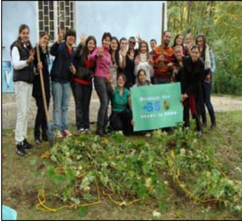
Students and teachers took part in the wild geranium planting