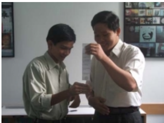
...testing speed reactions...

The British Council in Vietnam organised four days of ZeroCarbonCity activities in Ho Chi Min City this week, January 11-14 th , 2006. I naively expected temperatures similar to Hanoi in December but was surprised to be hit by the mid 30s in HCMC.