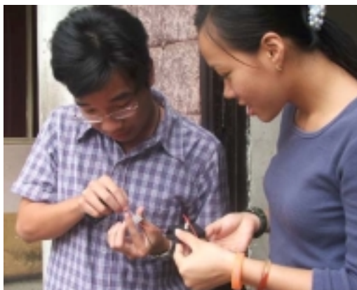
... volunteers getting in some practice...

A team of student volunteers from the Department of Foreign Trade lended invaluable help to the Science Celebration days for over 600 16-22 year-old school and university from HCMC.