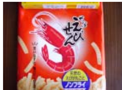
Kappa Ebisen (Front view of the package)