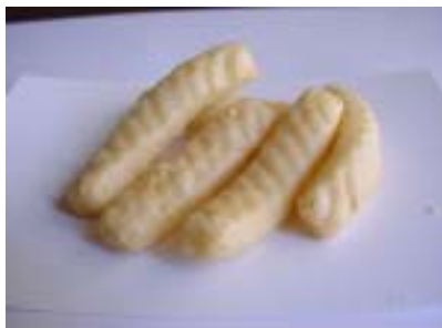
Kappa Ebisen (Kappa shrimp rice cracker)

Manufactured: Echigo Seika Co., Ltd. Address: (not to translate)