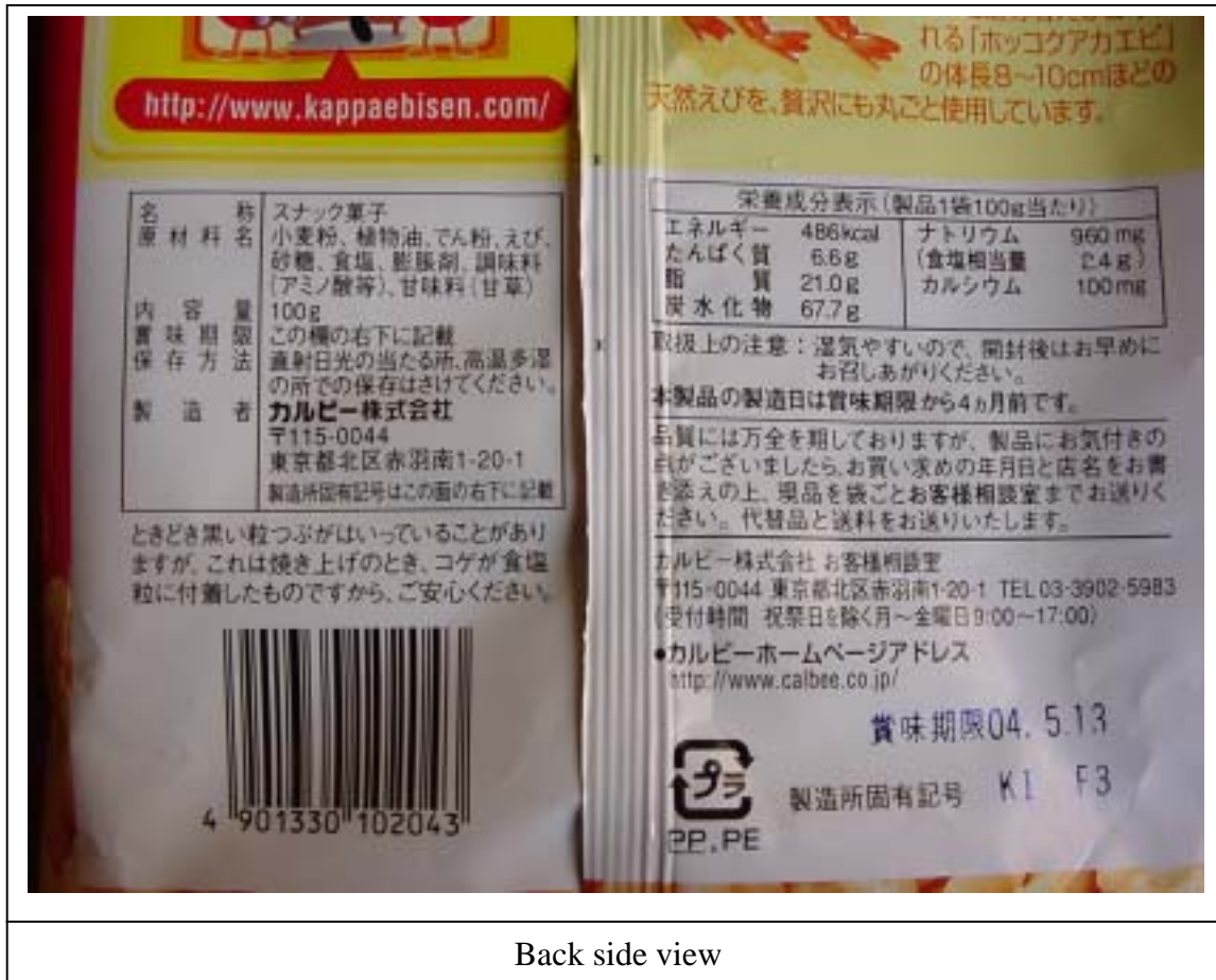
Back side view