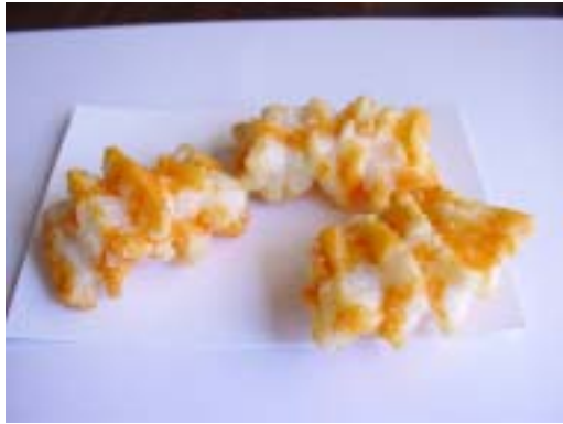
Brand name: UNI-ARARE (Rice cracker with sea urchin flavour)